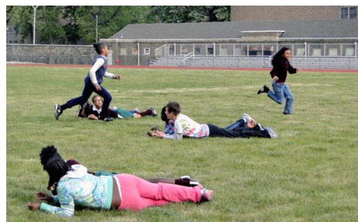
Above: Girls at Girard College sharpening their soccer skills and having fun together during the regular afternoon sessions.