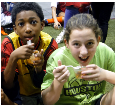
The food is a hit with our kids!