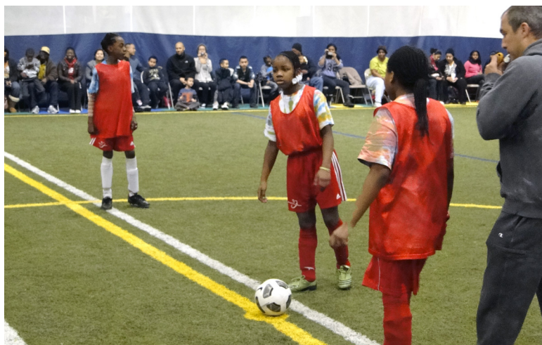
Below: The "Be One" tournament at Starfinder brought together all of the Soccer Girls Rule participants and their families for a day of spirited competition.