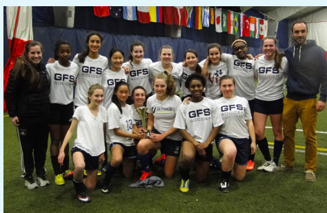
Clockwise from bottom left: Germantown Friends School Girls Team, Germantown Friends School Boys Team, Starfinder G1 Team, Carver High School of Engineering and Science, Starfinder B3 Team